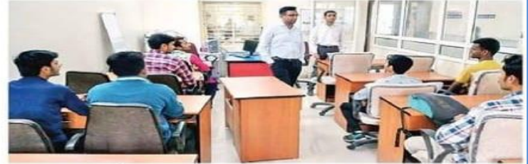
इंदौर • डीबी स्टार

बाहरी वर्करों के चले जाने से मॉल, ऑनलाइन डिलेवरी और रिटेल आदि सेक्टर में 300 वर्कर कम हो गए हैं। अफसरों के मुताबिक इन वैकेंसियों में स्थानीय युवाओं के लिए रोजगार के अवसर बढ़ेंगे।