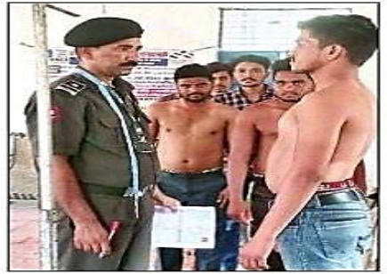
राउनावि अरथुंना में आयोजित मर्ती शिविर में युवाओं का शारीरिक व फिजिकल टेस्ट लेते अधिकारी।

के बाद 10 युकाओं का चयन किया गया। का आयोजन किया जाएका। आज मंगलचार को राउमाबि सर्वनगढ़ में भर्ती शिविर लगेगा चहाँ 20 को राउमाबि छोटो सरबन, 21 को राउमाबि गंगहकालाई, 22 को राउमाबि बांसवाड़ा में भर्ती शिविर में 500 सुरक्षा जवान एवं सुरक्षा अधिकारी को भर्ती को जाएगी। जो अभ्ययों इसका लाभ लेना चाहते हैं वे 10वीं, 12वों को मार्कशीट, दो पासपोर्ट साइज फोटो और आधार कार्ड के साथ निधारित शिव्यों पर उपस्थित हो सकते हैं। बाद प्रशिक्षण के बाद पाली. अजमेर, उदयपर, जयपर, जीधपर, निधारति तिथ्या पर उपस्थित हो सकते हैं। बाद प्रशिक्षण के बाद पाली, अजमेर, उदयुप, जस्पूर, जोपपुर, अजमेर, मारुति सुजकी भारत सरकार के ऐतिहासिक स्मारकों चित्ती हुगढ़ का किला कुंभलगढ़ दुर्ग, जेके सीमेंट, लाफार्ज सीमेंट, कुंभलगढ़ का किला आईएमएस आईआईटी एवं प्रतिष्ठान उद्योग संस्थानों एवं क्षेत्रों में रोजगार मुहेंय कराया जाएगा इच्छुक अभ्ययों अपने मूल दस्तावेजों के साथ निर्धारित तिथ्व को निर्धारित स्थान पर समय से उपस्थित होकर भाग ले सकते हैं।