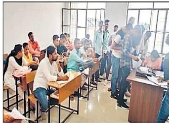
गौराबाजार में मंगलवार को साक्षात्कार को पहुंचे अभ्यर्थी।