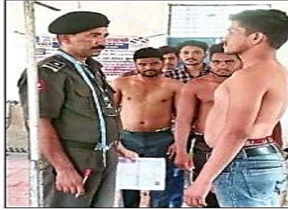
राउमावि अरधुना में आयोजित भर्ती शिविर में युवाओं का शारीरिक व फिजिकल टेस्ट लेते अधिकारी।

आज मंगलवार को राउमावि सम्मनगढ़ में भर्ती शिविर लगभग वहीं 20 को राउमावि छोटी सरवन, 21 को राउमावि गण्डतलाई, 22 को राउमावि चांसवाड़ा में भर्ती शिविर में 500 सुरक्षा जवान एवं सुरक्षा अधिकारियों को भर्ती को जाएगा। जो अभ्यर्थी इसका लाभ लेना चाहते हैं वे 10वीं, 12वीं को मार्कशीट, दो पासपोर्ट साइज फोटो और आधार कार्ड के साथ निर्धारित तिथियों पर उपस्थित हो सकते हैं। बाद प्रशिक्षण के बाद पाली, अजमेर, उदयपुर, जयपुर, जोधपुर, अजमेर, मारुति सुजको भारत सरकार के ऐतिहासिक स्मारकों विसीडगढ़ का किला कुंभलगढ़ दुर्ग, जेके सोमेट, लाफार्ज सोमेट, कुंभलगढ़ का किला आईएमएस आईआईटी एवं प्रतिष्ठान उद्योग संस्थानों एवं क्षेत्रों में रोजगार मुहैया कराया जाएगा। इच्छुक अभ्यर्थी अपने मूल दस्तावेजों के साथ निर्धारित तिथि को निर्धारित स्थान पर समय से उपस्थित होकर भाग ले सकते हैं।