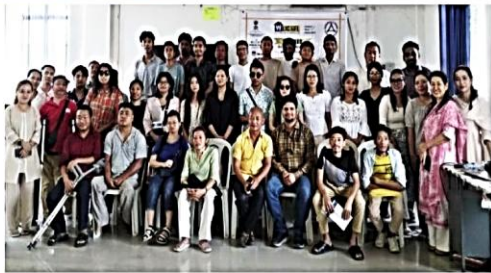
A Seminar on 'Career Counselling and Entrepreneurship' was held for Persons with Disabilities (PwDs) at the Conference Hall, District Hospital Dimapur on April 26.