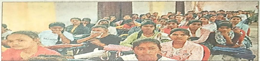
कर्मयोगी डिग्री कॉलेज में आयोजित रोजगार मेले में मौजूद अभ्यर्थी।

रायबरेली। जिला सेवायोजन कार्यालय की ओर से मंगलवार को कर्मयोगी डिग्री कॉलेज मुलिहामऊ में रोजगार मेले का आयोजन किया गया। इसमें कई कंपनियों के प्रतिनिधियों ने विद्यार्थियों का साक्षात्कार लिया। इसमें 409 लोगों को रोजगार के चुना गया। बेरोजगारों का चयन होने से उनके चेहरे खुशी से खिल उठे।