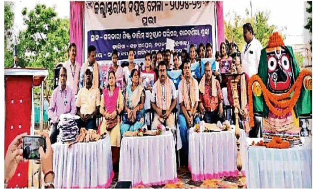
जिला स्तरीय रोजगार मेले में मंचसीन अतिथि • वाद्यराज